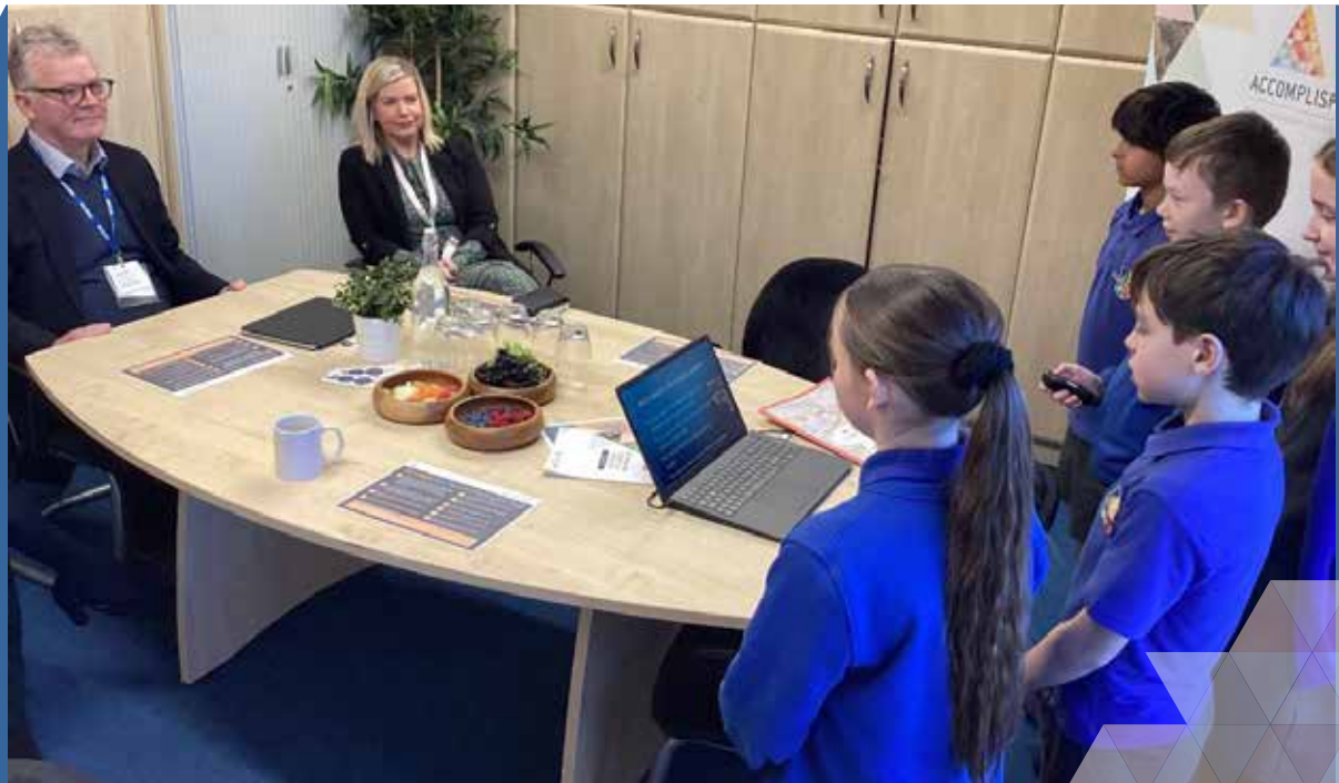
JCA Junior Leaders

Our Accomplish Oracy strategy is becoming embedded across the school; children are constantly empowering others through their talk!