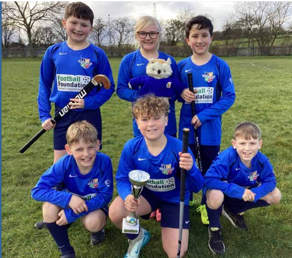
JCA Hockey Team

A number of children have celebrated their own achievements this term! Lots of children have earned pen licenses for the care they have given to their presentation across the curriculum.