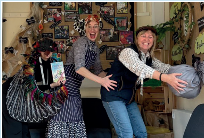
Celebrating World Book Day across the trust was truly magical