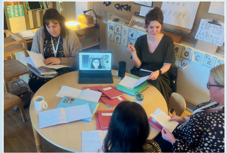
Curriculum networks continue to strengthen our commitment to ensuring the best education for all

These values unite us, define our purpose, and fuel our determination to provide the very best for every child. I am immensely proud of what we are achieving together and grateful for the unwavering commitment shown across our trust.